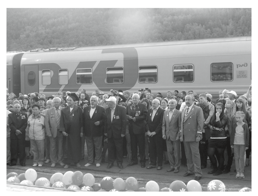
Figure 6. Awards ceremony, fortieth anniversary of the BAM.

remakes of patriotic war songs performed by pop stars and accompanied by public karaoke singing. Two concerts were held simultaneously in the central city park and at the stadium called "BAM." In the latter location another momentous event, a teleconference with the state leader, took place. The president did not only congratulate bamovtsy with the event, but "committed" to a ritual of the Silver Spike. The ritual symbolized the joining of the first sections of the second railroad track between the stations of Taksimo and Lod'ia and the first achievement of the current modernization program BAM-2. The ritual immediately triggered the memory of the first Silver Spike ceremony in 1975 that symbolized the joining of the first railroad tracks Tynda-Chara, thus, reconnecting BAM-1 and BAM-2. The public celebrations were closed with festive fireworks.