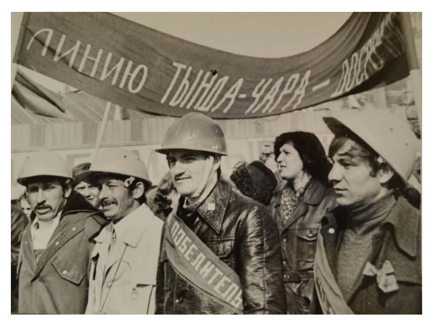
Figure 3. BAM builders with slogans at a demonstration.