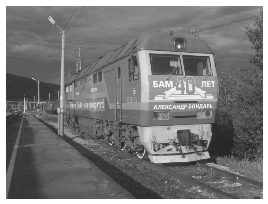
Figure 5. Train "40th Anniversary of the BAM."

Two trains coming from the opposite directions—from Irkutsk in the west and Khabarovsk in the east—left to meet in the city of Tynda and stopped at every BAM station and settlement to celebrate the anniversary. Their passengers were BAM veterans, who met the second generation of BAM builders at every stop.