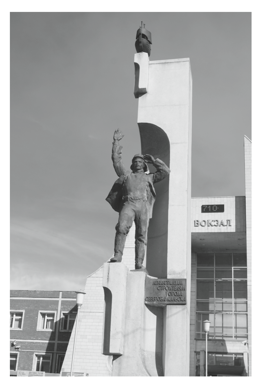
Figure 4. Monument to the BAM builder, Severobaikal'sk Railway Station. Author: Peter Schweitzer.